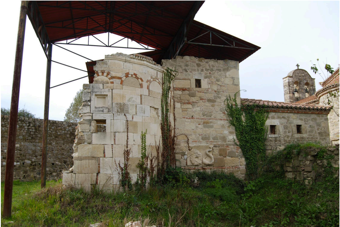
Fig. 5: The Church of the Entrance of the Virgin to the Temple, view from East, 1782, Kolkondas, Fier, central Albania