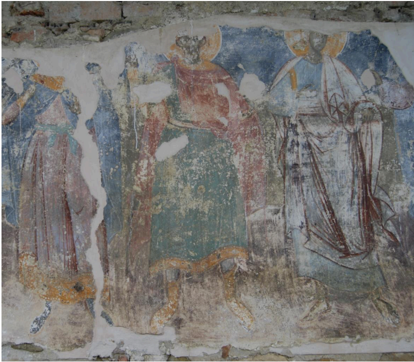
Fig. 11: Anonymous, St John Vladimir, fresco, Northern wall, last part of 18 th century, Church of the Entrance of the Virgin to the Temple, Kolkondas, Fier, central Albania