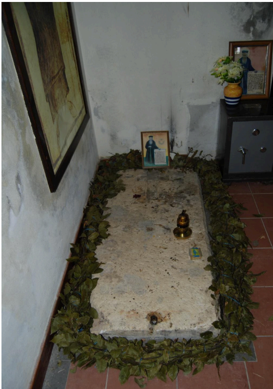
Fig. 2: St Kosmas the Aetolian's Tomb, view from East, late 18 th century, Kolkondas, Fier, central Albania.