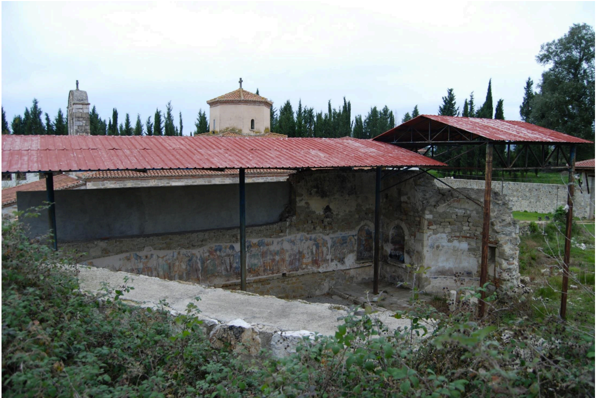
Fig. 3: The Church of the Entrance of the Virgin to the Temple, view from South-West, 1782, Kolkondas, Fier, central Albania