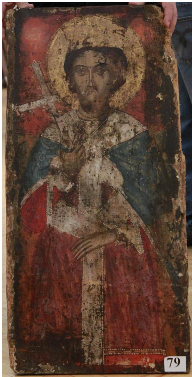
Fig. 10: Anonymous, St John Vladimir, fresco, second pictorial phase of the church of St. Nicholas at Shelcan, Shpat, Elbasan, central Albania and the formerly stolen icon of St John Vladimir currently kept at the National Historical Museum in Tirana