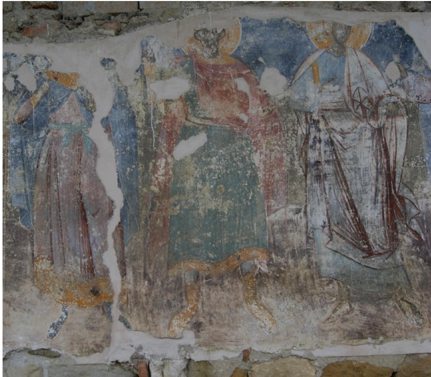
Fig. 7: Anonymous, St John Vladimir, fresco, Northern wall, last part of 18 th century, Church of the Entrance of the Virgin to the Temple, Kolkondas, Fier, central Albania