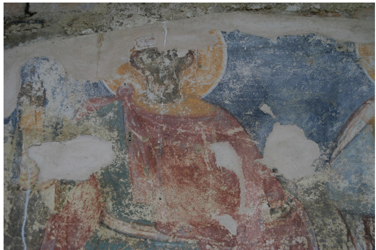
Fig. 9: Anonymous, St John Vladimir, fresco, Northern wall, last part of 18 th century, Church of the Entrance of the Virgin to the Temple, Kolkondas, Fier, central Albania