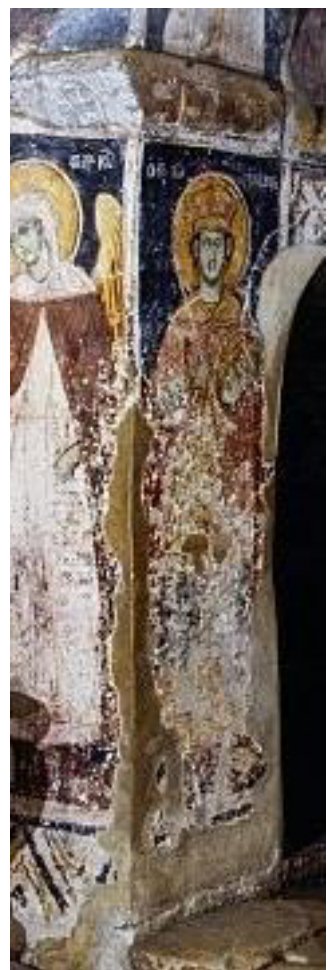
Terpo, son of painter Constantine from Korça, St. John Vladimir, 1810, Catholicon of the Monastery of St. Naoum, wall painting, fresco, Ohrid [7, p. 183]