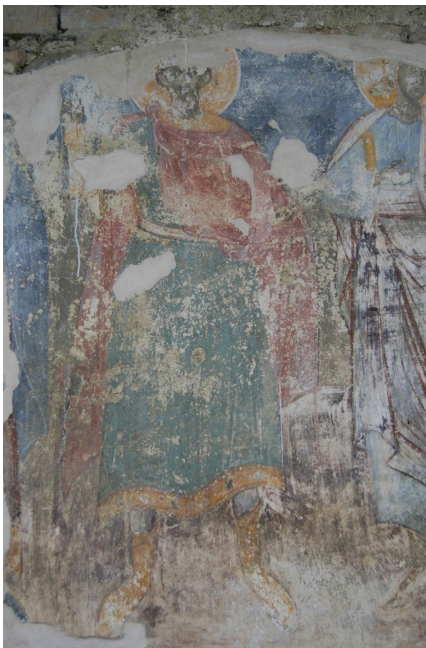
Fig. 8: Anonymous, St John Vladimir, fresco, Northern wall, last part of 18 th century, Church of the Entrance of the Virgin to the Temple, Kolkondas, Fier, central Albania