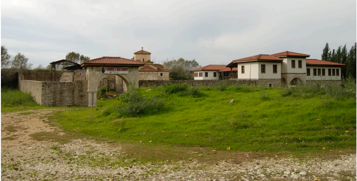
Fig. 1: The Monastery of the Entrance of the Virgin to the Temple and St Kosmas the Aetolian, view from East, 18 th -21 st century, Kolkondas, Fier, central Albania.